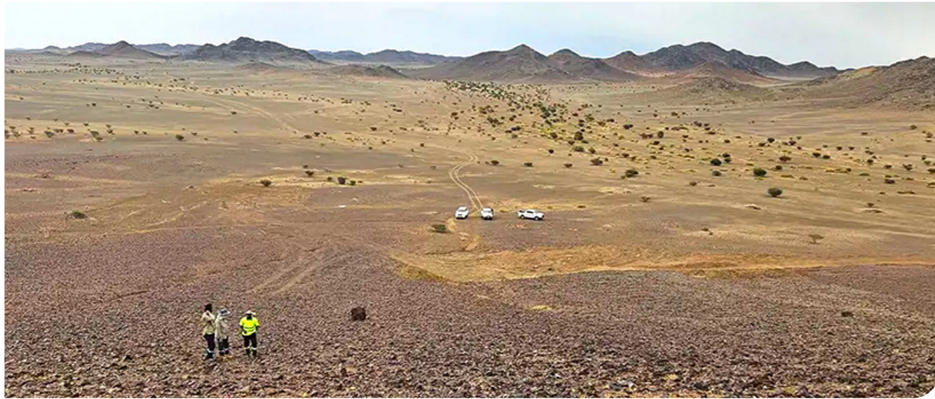
↑ Maaden Project: SRK conducted a mineral prospectivity study of the Arabian Shield over an eight-year period.