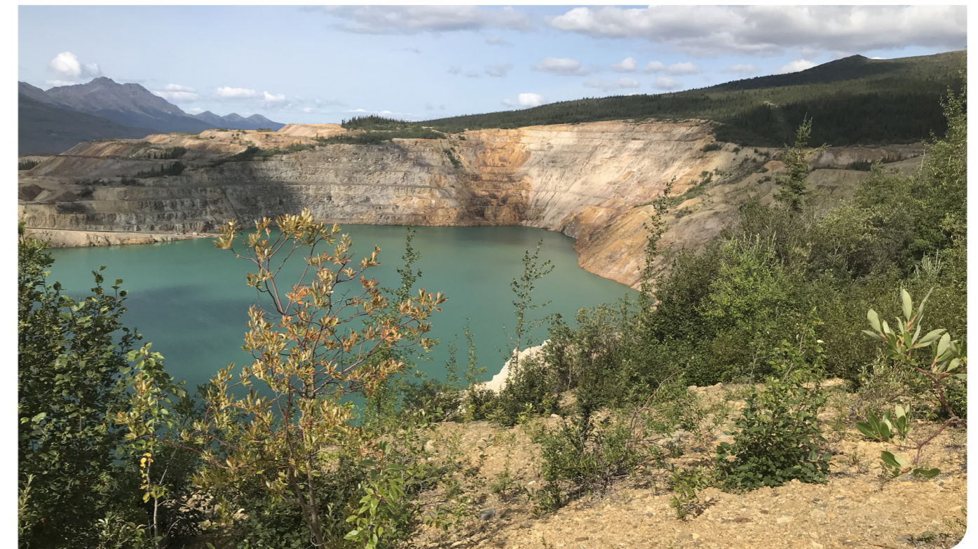
↑ Faro Mine Complex