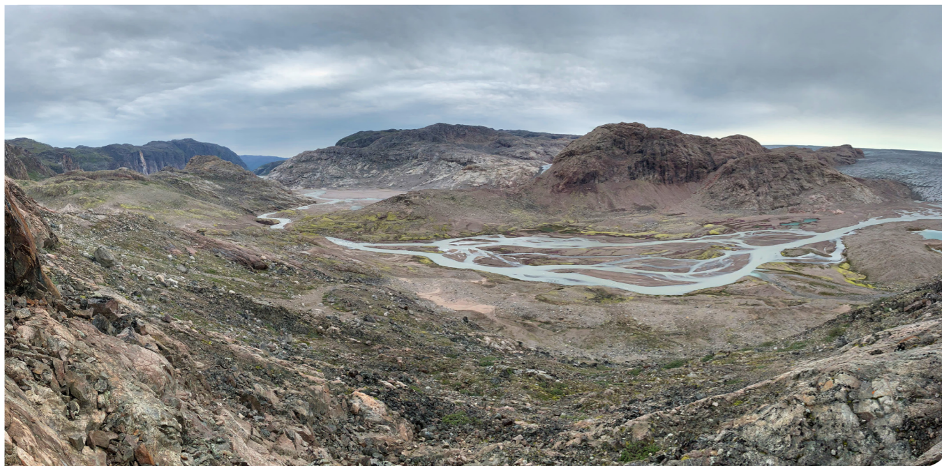
↑ Sava Project: Secondary copper-bearing gossan (left) exposure discovered during mapping and soil sampling at the edge of the Greenland Ice Sheet (2021)

The project followed a four-stage workflow designed to maximize the value of data coverage and to implement a systems-based approach to regional exploration: