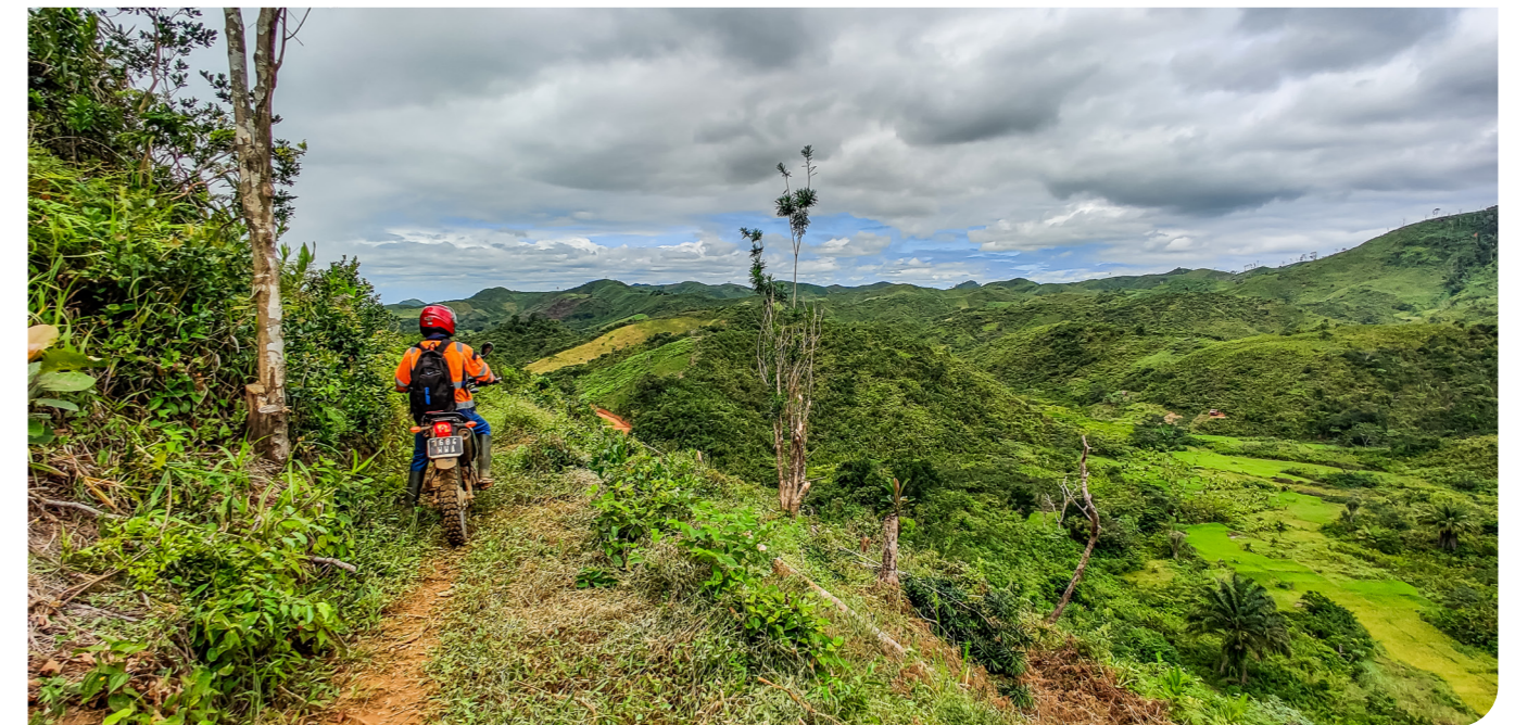
↑ Producing a Competent Person's Report on the Vatomina and Sahamamy graphite projects in Madagascar (2022)